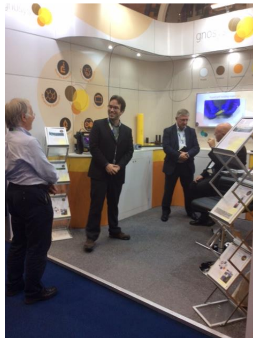
Talking shop at the Gnosys stand