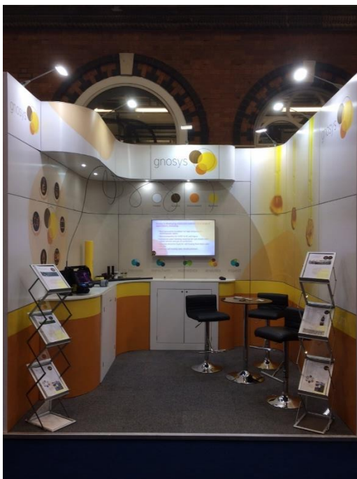
The Gnosys stand at LCNI

Gnosys showcased several innovative technologies, including non-destructive condition assessment techniques, novel insulation materials, and self-healing polymers for cable protection systems. We were approached by companies with interests in these areas, with the potential for future collaborations arising from this event.